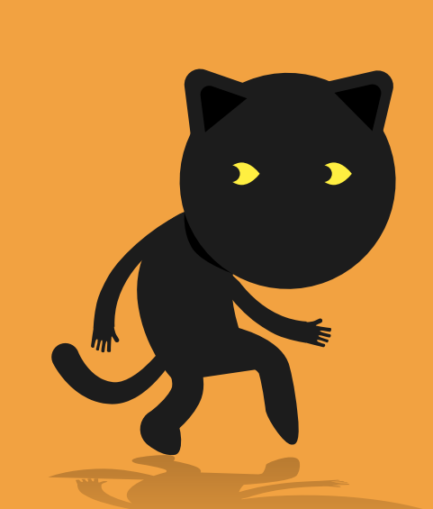
Uptick in curiosity