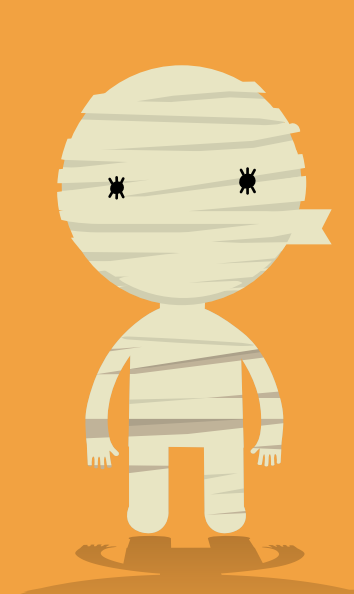
Decrease in communication