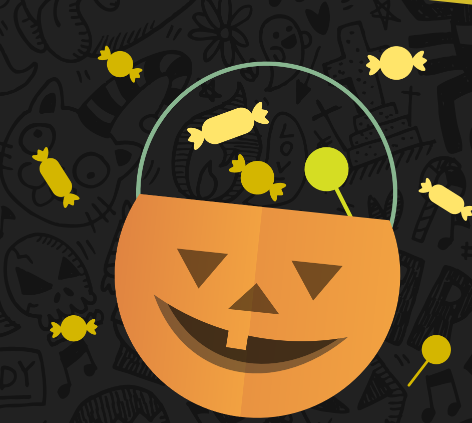
Are your kids trick-or-treating without an adult / as a group for the first time?

Model responsible behavior and have frequent conversations.