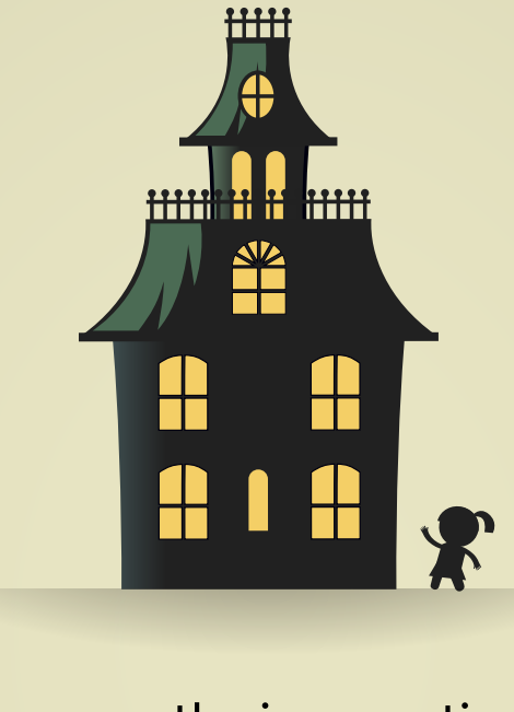
Answer their questions before they leave the house — make sure they know all the facts.