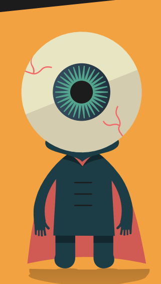
Eye roll habits

Signs your kids are transforming into a middle schoolers